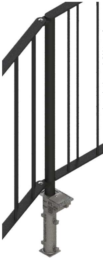
Lee pedestrian guardrail (vista panel)

Removable pedestrian guardrails may be used for easy maintenance and replacement of damaged panels in high-risk knockdown areas.