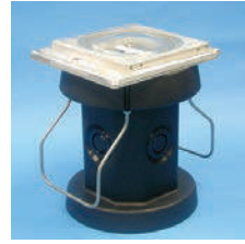
GLOBAL Plus with CABEX