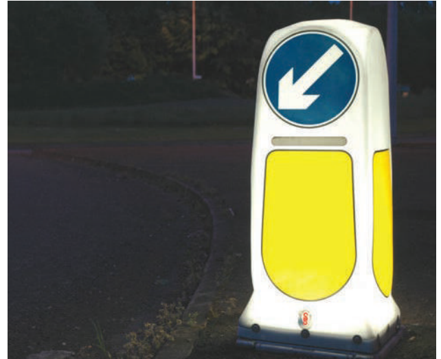
BS EN 12899:2007 Type 1 TTB, IR3, OH1