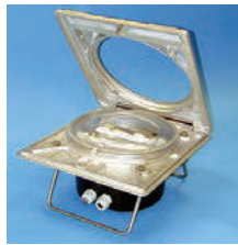
GLOBAL Plus Freestanding